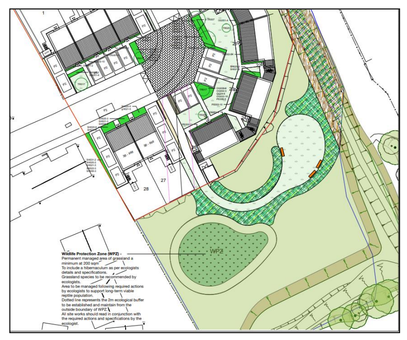
Figure 1 – Extract from Proposed Site Landscaping Plan

The Council's Supplementary Planning Guidance indicates that wherever possible public open space should be within the boundaries of the development site as an integral part of the development. From the submitted layout plan (see extract below) over 2,000 square metres of open space will be provided which exceeds the total requirement set out in the formula above.